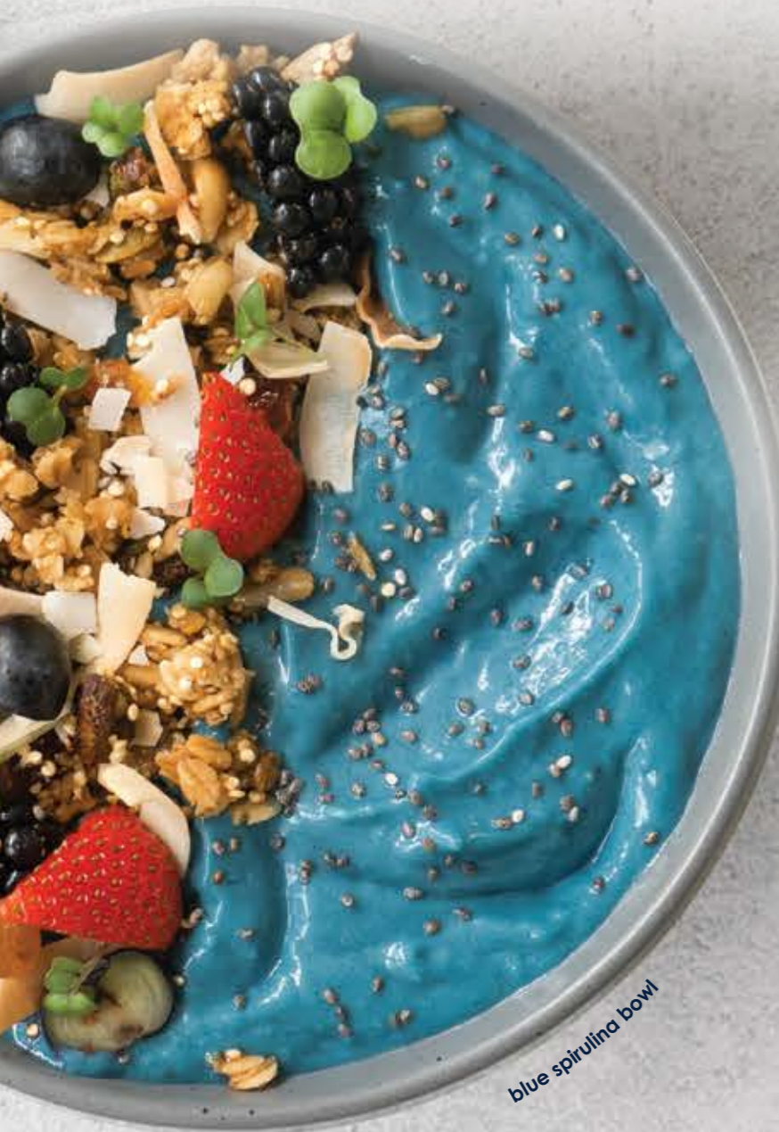
blue spirulina bowl

Breakfast is served until 12pm weekdays and 4pm weekends and public holidays.