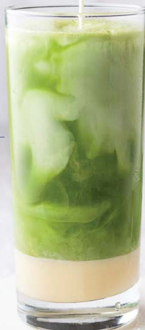
iced matcha latte